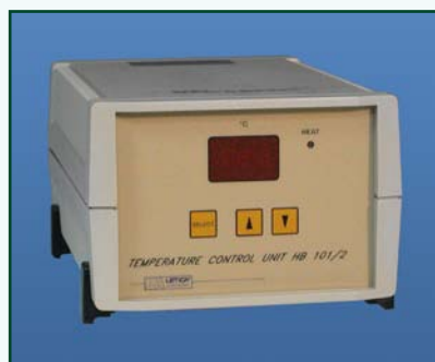
16 x 11 x 25 cm

The control unit, HB 101 is the same for any kind of blanket or plate. It disposes a control for being able to check the good work of temperature probe.